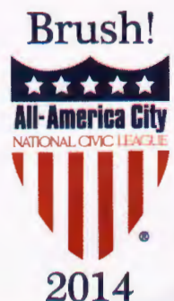
Charles R Bain Mayor City of Brush!

A handwritten signature in blue ink that reads 'Charles R. Bain'.